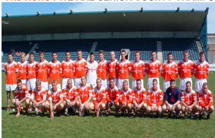
St Brigid's Senior Football Squad 2003

The Game. Brigid's went into the contest as underdogs, but in front of an estimated 6,500 crowd, we belied that tag with a swashbuckling display that was crowned by some brilliantly executed points.