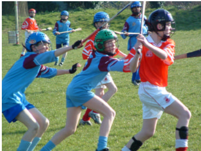
Action from a Recent U13 Hurling League Game

Our Juvenile Section the lifeblood of Brigids for so long is going very strong. At the last count we had over 330 Juvenile players. Last Years pride of place has to go to our U-15's who won both the Juvenile Hurling and Football Championships a unique double in Dublin.